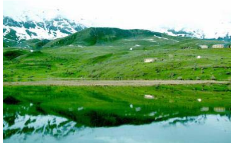
Batabat - Shahbuz, Nakhchivan