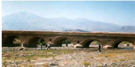
Aza Bridge - Ordubad, Nakhchivan – 1826

Your walking tour of Baku includes the medieval walled city "Icheri Sheher" with its narrow alleyways, historic caravanserais, mosques and Palace of the Shirvan Shahs. Visit the 12th century Maiden's Tower, the imposing mansions of the oil barons, built in the oil boom of 1870-1914 and Martyr's Alley with its superb views over the Bay of Baku.