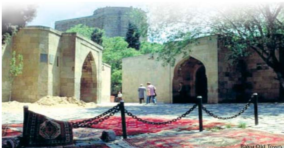
Baku Old Town